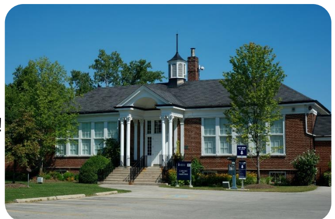
1963-1973 Springbank Community Center